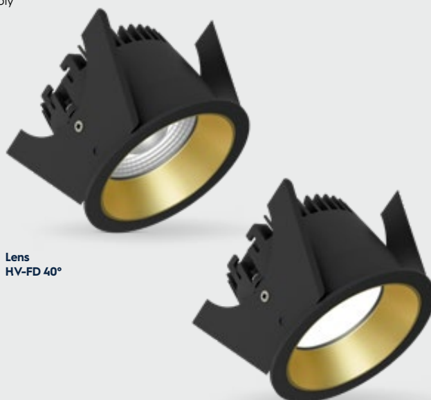
Lens HV-FD 40°